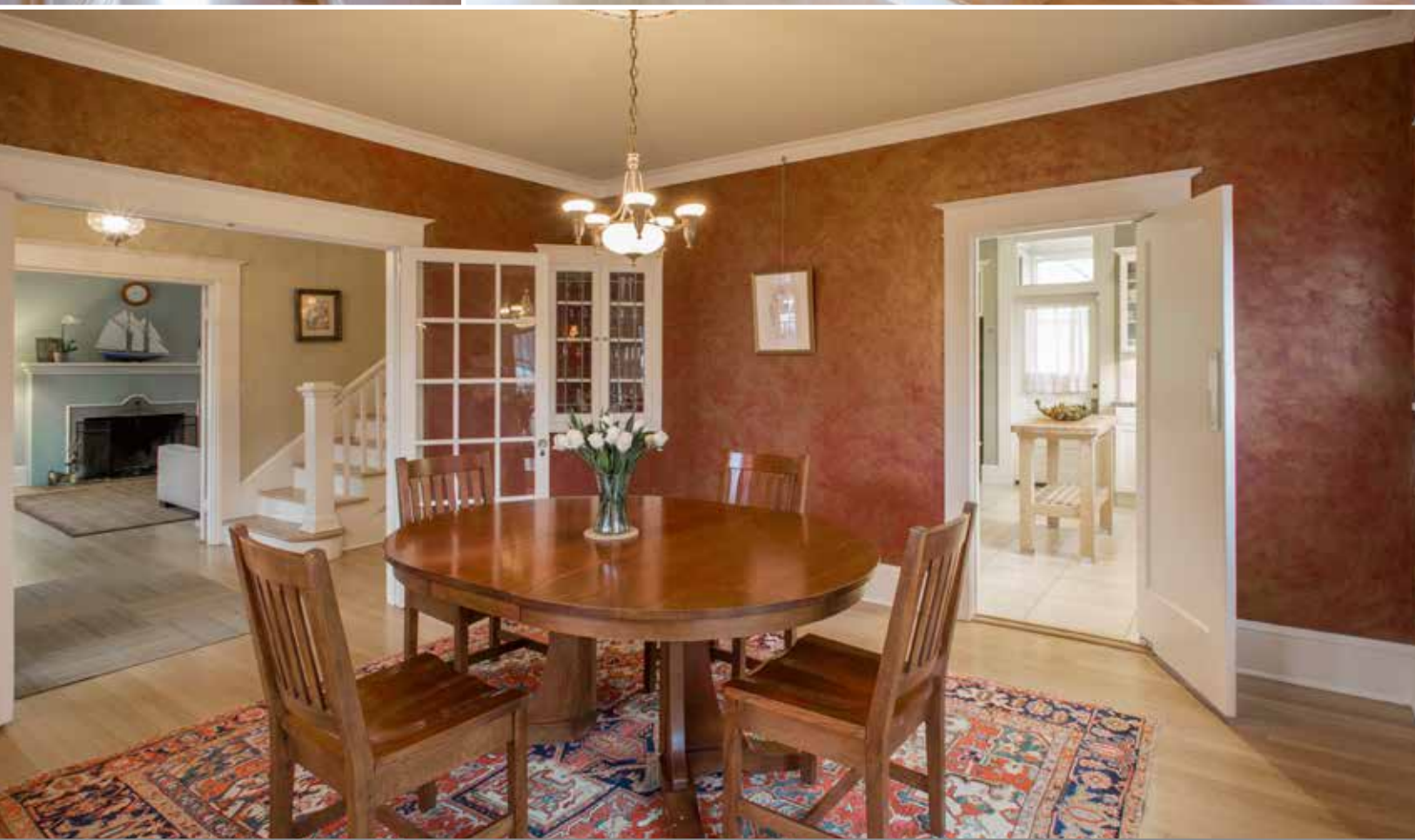
CLASSIC FLOORPLAN WITH CENTRAL STAIRCASE & QUALITY ARCHITECTURAL DETAILS