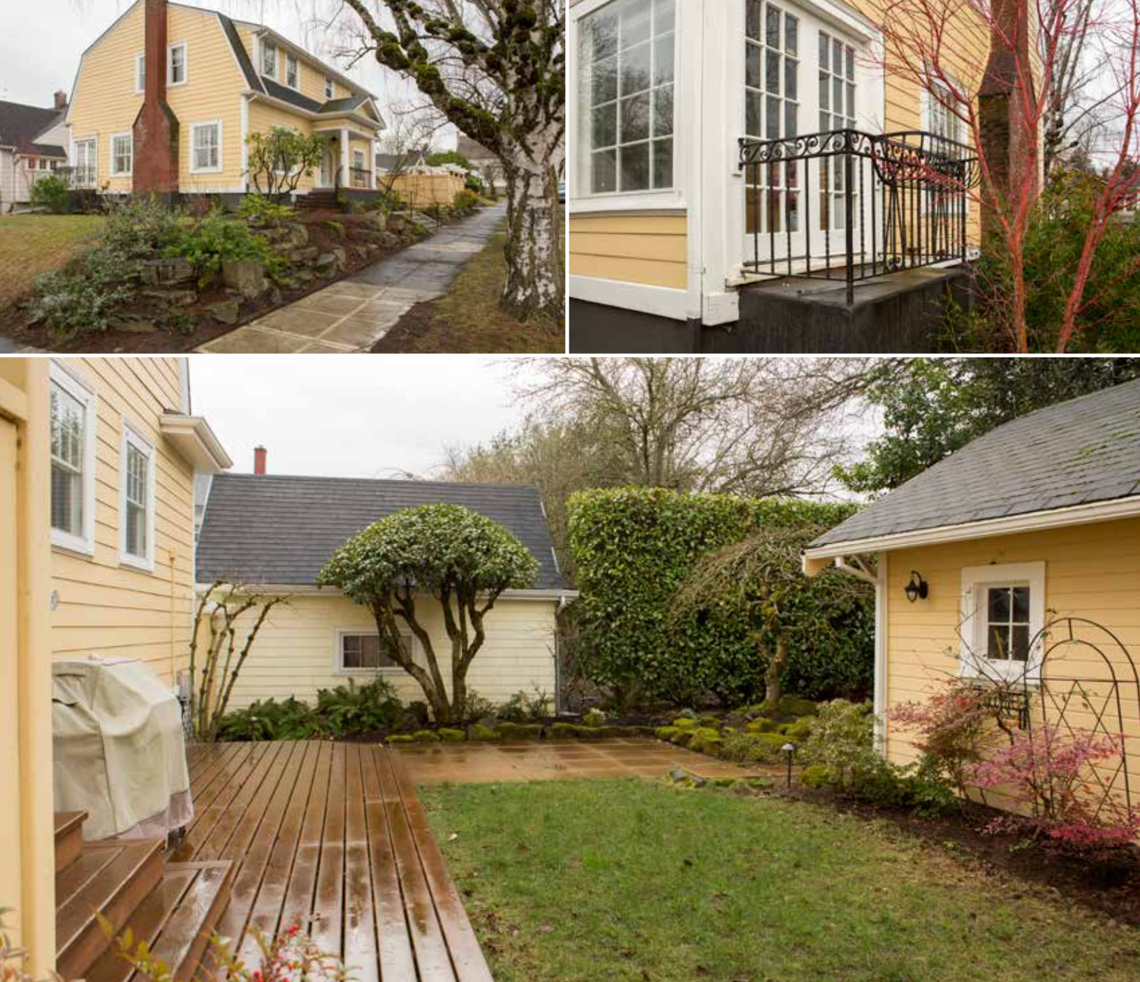
ATTRACTIVE CORNER LOT - FENCED SIDE YARD - DETACHED SINGLE CAR GARAGE