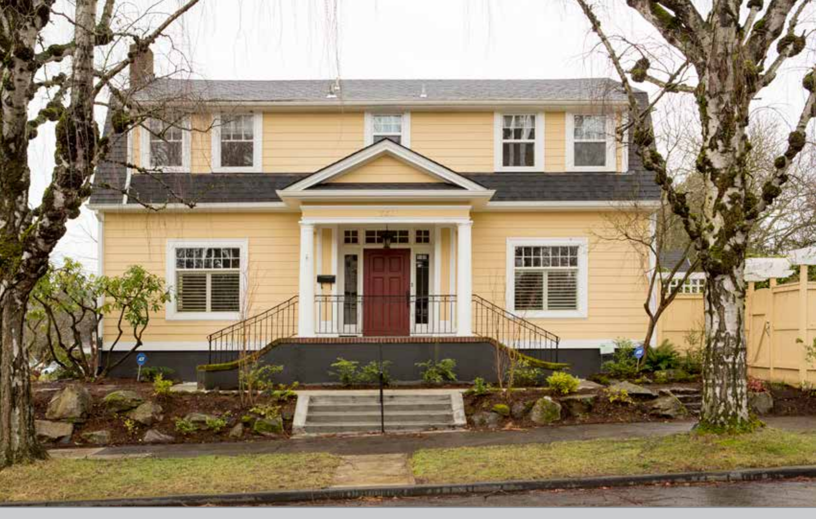
730 NE STANTON STREET, PORTLAND, OR 97212