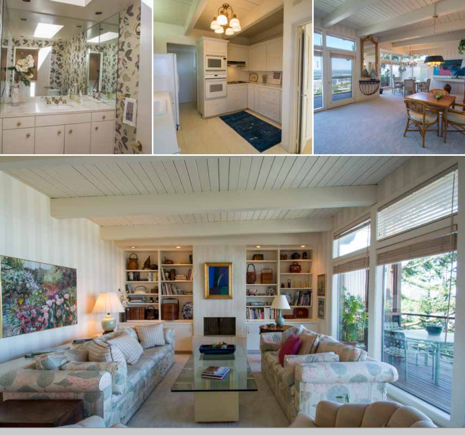
AIRY OPEN PLAN MAIN FLOOR • PANORAMIC VIEWS!