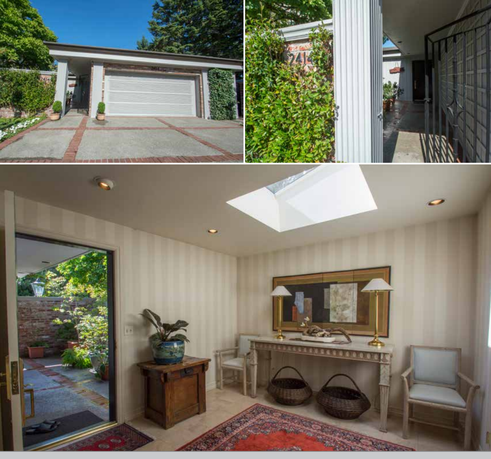
SPACIOUS ENTRY • ABUNDANT NATURAL LIGHT THROUGHOUT